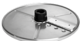
JULIENNE CUTTER 2x2 mm