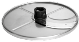
SLICER 4 mm