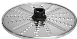
GRATER/SHREDDER 4 mm