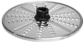
GRATER/SHREDDER 4 mm