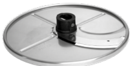
SLICER 4 mm