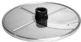
SLICER 2 mm